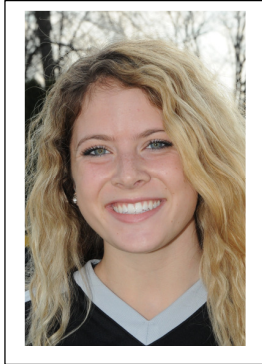
16 Jessie Buckley