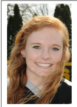
14 Lillie Ledbetter