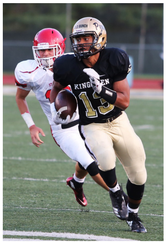
as he sprinted past his blocker with the ball, two more were closing in quickly. He had to

Though he could hear footsteps pounding against the turf as the opponents swarmed in for the tackle, he resisted the urge to look away from the ball. He had barely caught the ball before one of them dived for his legs. Spinning quickly he maintained his balance, but more tacklers were on the way. Glancing left, he saw his teammate block one would-be tackler, but