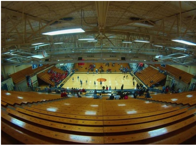
Northside Gym